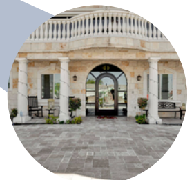
CASA VAIENCIA @ ARCADIA

CLICK ON THE NAME OF THE HOMES TO GET DIRECTIONS