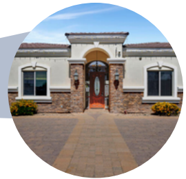
THE IV @ ARCADIA