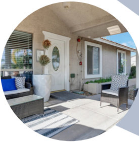
VAIENCIA @ 19TH #1