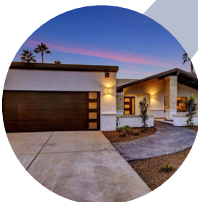
VAIENCIA @ 47TH