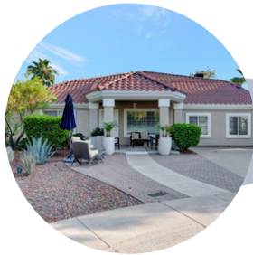
VAIENCIA @ 19TH #2