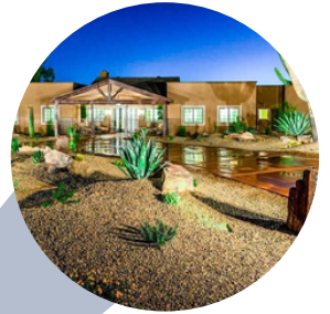
NORTH SCOTTSDALE RETREAT