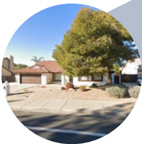
VAIENCIA @ 60TH